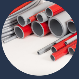
Flexalen PB Pipes

A state-of-the-art solution for age-old heritage