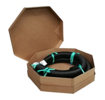
Set Content Flexalen 600 double pipe with oxygen barrier

All-in-one pre-insulated pipe package for quick and efficient A to B connections